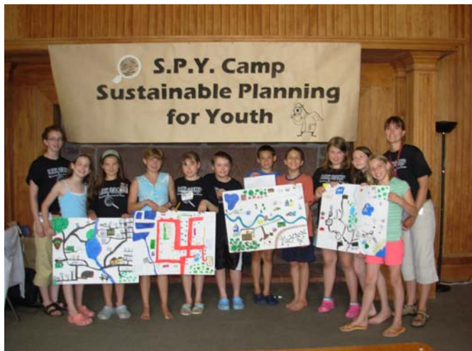
Photo caption: Participants in the SPY Camps, offered by Mount Allison University's Rural and Small Town Programme, display community plans they developed as part of the program.