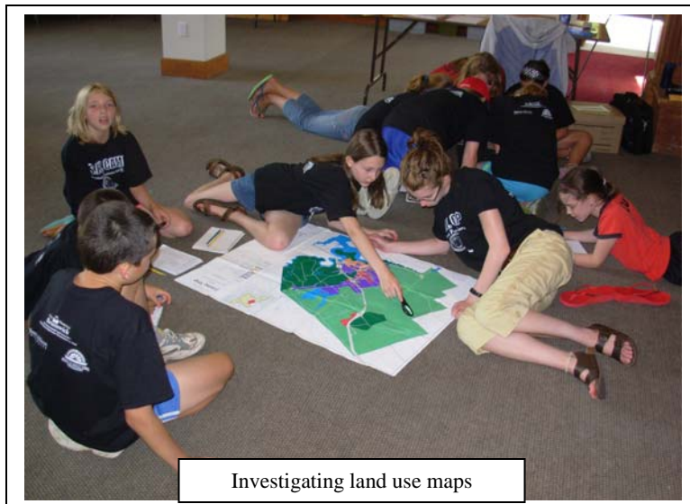
Investigating land use maps

With funding from the New Brunswick Environmental Trust Fund and Mount Allison University, 10 to 12 year old detectives explored and investigated their local community, land use planning, sustainable development, environmental issues, heritage and culture