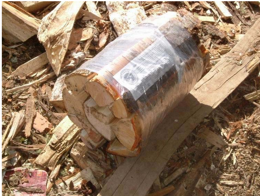
Fig. 2. Firewood bundled for Fundy National Park. The 2005 firewood supply was provided by landowners participating in the Pollett River Watershed Project, and was sold for a price premium that will be split between the project and supplying landowners.