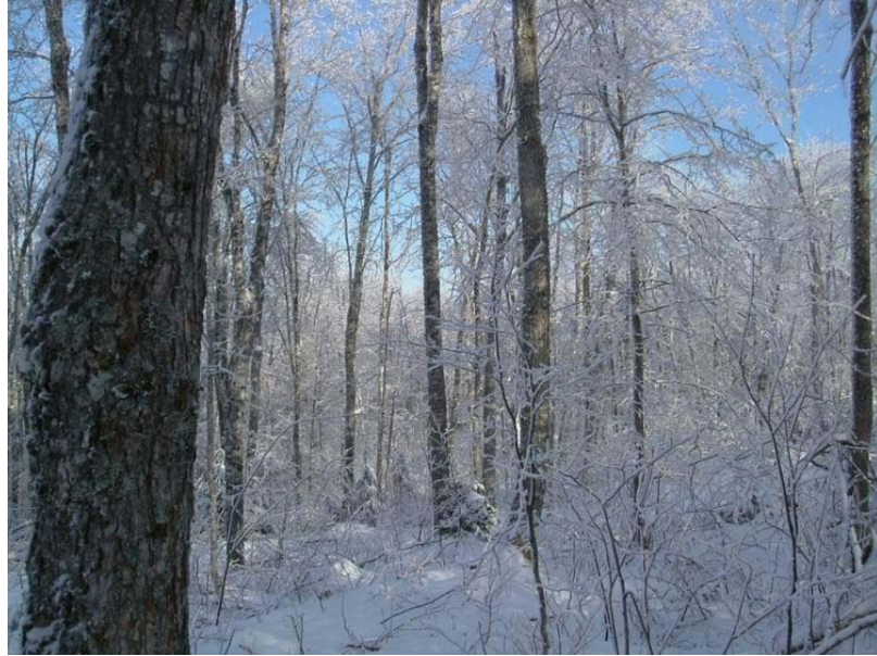
Fig. 1. This sugar maple stand is the source of Fundy National Park's 2005 campfire wood. The stand is part of the Pollett River Watershed Project and was selection harvested with a 30% removal shortly before this photo was taken.